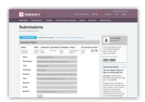
Execute better with Improvelt by launching, monitoring, and tracking performance and quality improvement projects online.