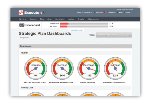
Execute faster with Executelt using tools to drive collaboration, accountability, and execution

Whether you are a small organization with fewer than 100 employees or a national company with facilities from coast to coast, developing and executing strategies that will turn vision into reality is of critical importance. Plan poorly, and you are likely to be crushed by market forces. Execute poorly, and it's more of the same. But what if you could harness some powerful tools that enable you to execute smarter, faster, and better than your competitors? Well, now you can.