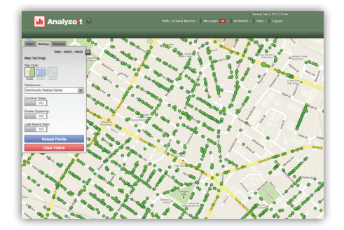
Execute smarter with Analyzelt by visualizing your data, before focusing your strategy discussions through point-and-click analytics.